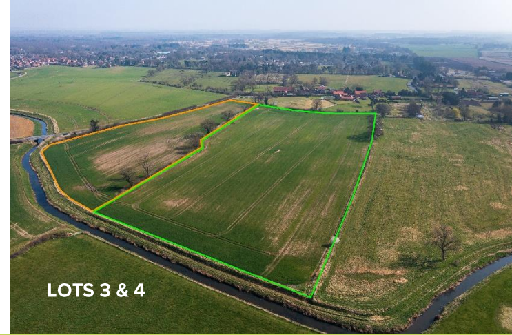
LOTS 3 & 4